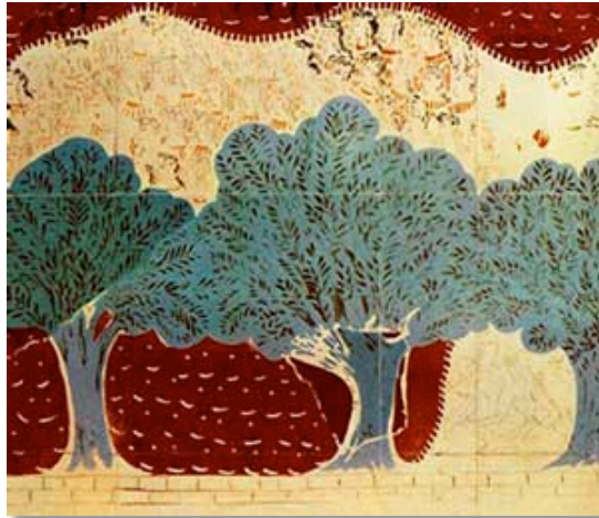
(Knossos, Crete, 1630-1500 BC )