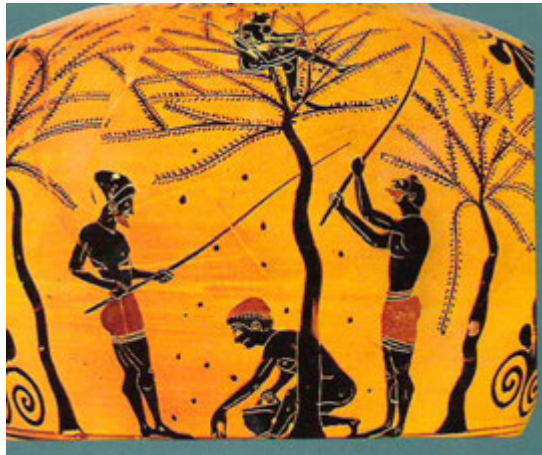
(Athens, 6 th century BC)